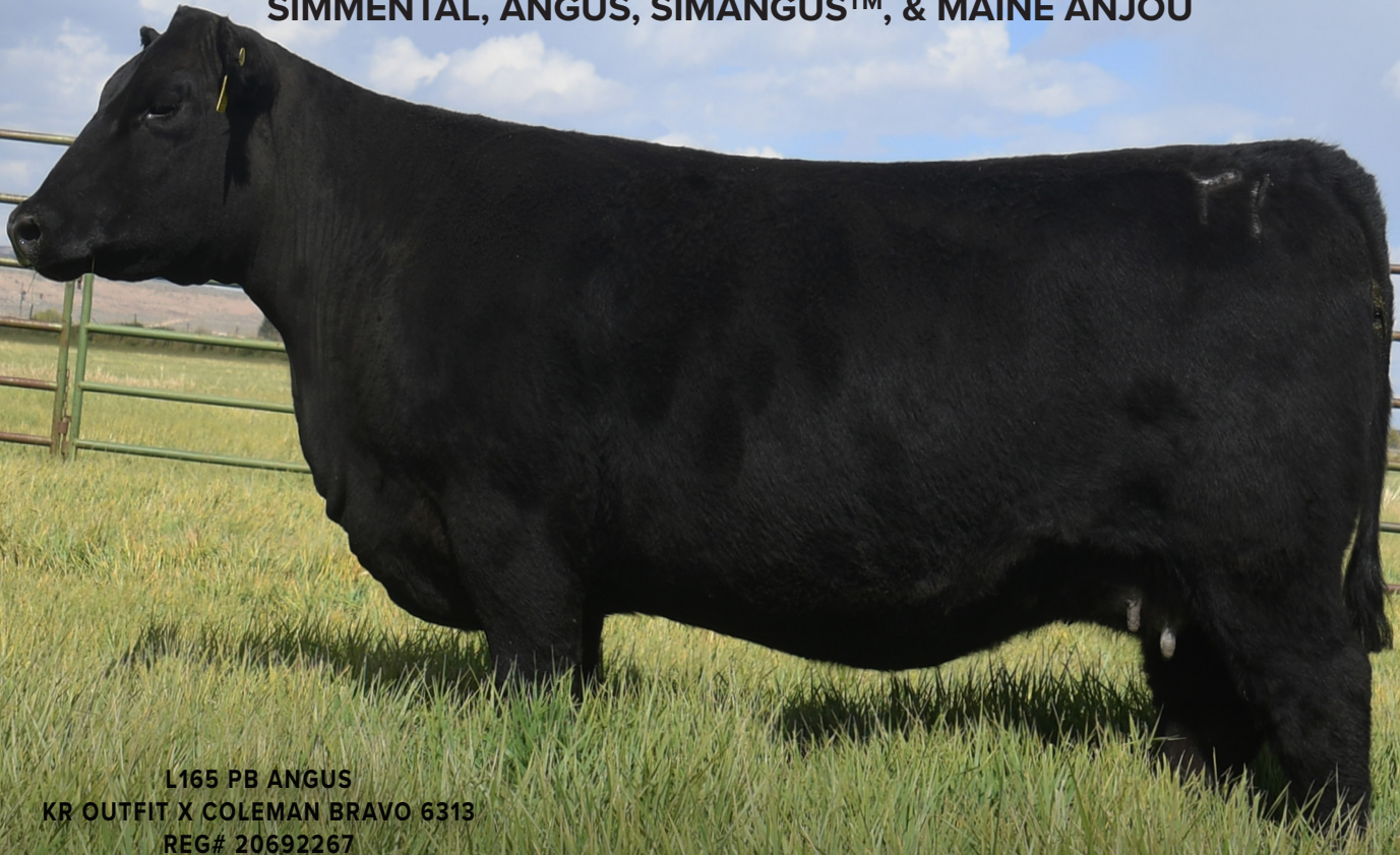
L165 PB ANGUS KR OUTFIT X COLEMAN BRAVO 6313 REG# 20692267

130 BRED HEIFERS AND COWS SELL! PICK OF THE HEIFER CROP! SIMMENTAL, ANGUS, SIMANGUS™, & MAINE ANJOU