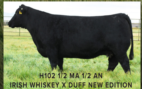
H102 1/2 MA 1/2 AN IRISH WHISKEY X DUFF NEW EDITION

TO REQUEST A CATALOG PLEASE VISIT OUR WEBSITE OR CALL (812) 525-0359