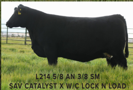
L214 5/8 AN 3/8 SM SAV CATALYST X W/C LOCK N LOAD