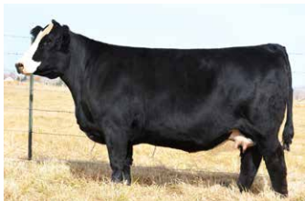
Beautiful dam of lot 120.

D163's beautiful baldy dam is one of our prettiest, stylish made, phenotypically perfect cows. Her donor dam produced the '15 $16,000 crowd favorite purchased by Bill Carsten of CO.