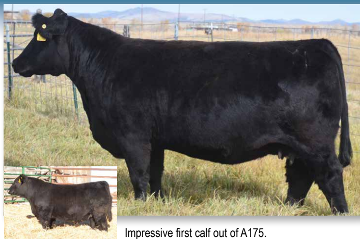
Impressive first calf out of A175.