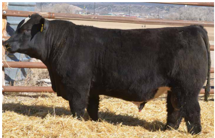
Powerful maternal brother to C157.