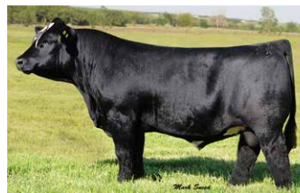
Yardley Showdown maternal brother to dam of lot 150