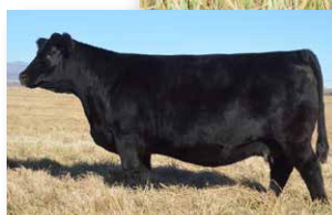
Powerful Grandam of D25.