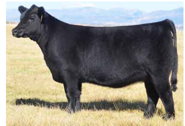
Stunning daughter of 1154