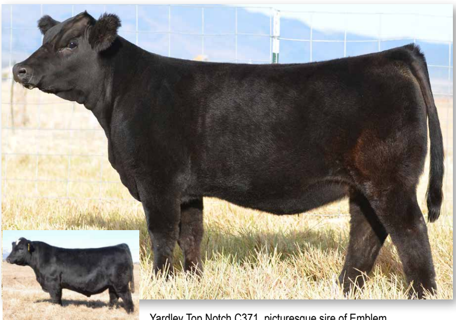
Yardley Top Notch C371, picturesque sire of Emblem

Emblem is the purebred Simmental that you've been searching the country over to find. She comes fully loaded with a powerful hip, pretty front, plenty of bone and style to burn. Her young, business oriented dam has done an exceptional job in her young career, weaning a 760# bull as a first calf heifer, Emblem is her second. Here's your chance at the purebred package and Emblem you've been looking for.