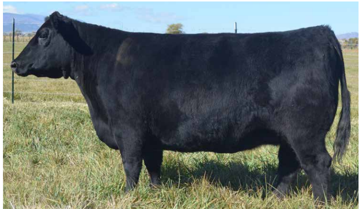
Beautiful daughter of W147.