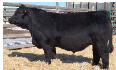
Maternal brother to D140.