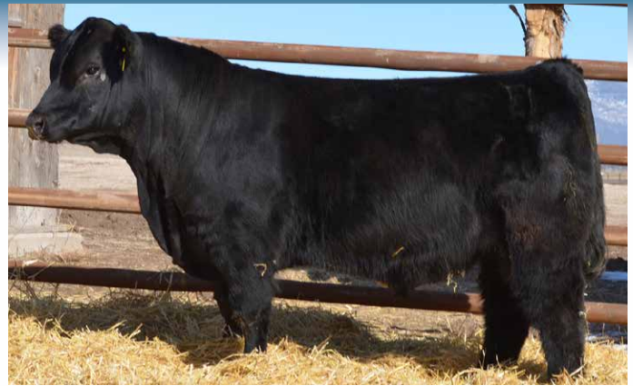
$16,000 maternal brother to C255.