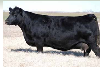
OCC 927K, legendary dam of 1154