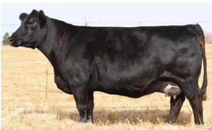
Miss Yardley S7, high - ratioing granddam

Don't let this fancy female slip by you sale day. Elusive has all of the defining characteristics of a Grand Champion show heifer. From her stout hip, to her extended front with depth sweeping from her fore rib to her flank and added capacity in the middle. Her perfection is built upon the shoulders of greatness. Her performance packed maternal grand dam, a cherished asset of our donor program, boasts the heaviest WW ratio of any aged matron on our ranch at 113 on ten calves that have averaged over 750#! Included in these highly coveted calves is an $11,000 bull in '16 and a $10,500 sale favorite in '15. Elusive is sure to carry on the family tradition in grand fashion. Recommended for an experienced showman.