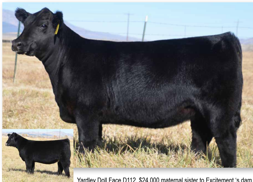
Yardley Doll Face D112, $24,000 maternal sister to Excitement's dam.

Excitement is all her name implies and more, This stylish show heifer is as broody and bold as they come. Her beautifully smooth, sweeping design extends from her keen head, kind eye, and zipper tight neck, through her smooth shoulder, back to her incredibly deep broody belly and strong top through to her nice hip and ideal leg set. Her stellar first calf dam is the favorite daughter of her gorgeous and profitable maternal grand dam, a cornerstone and key asset of our donor program who has produced a $20,000 and a $16,000 feature bred heifers. We turned down $16,000 for another daughter who went on to produce $24,000 feature Doll Face, in last year's sale purchased by renowned showman Greg Kroupa of SD. Excitement is more than just a pretty package, she's a female to build a herd around.