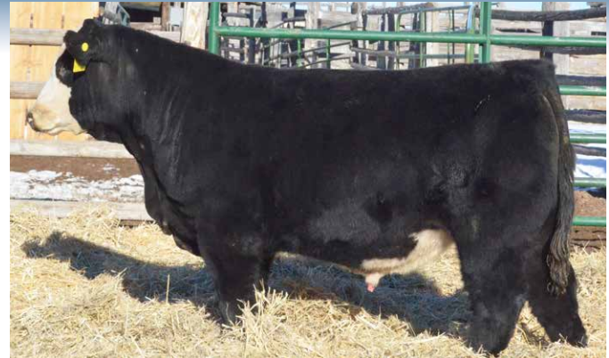
Maternal brother to D62.