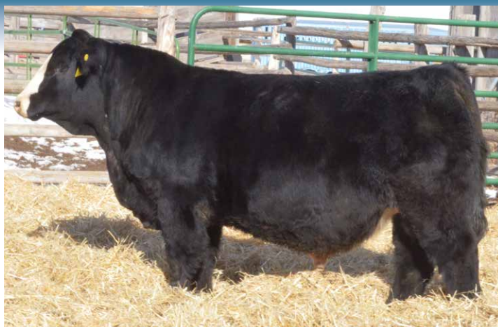
Yardley Game On $12,500 maternal brother of B134