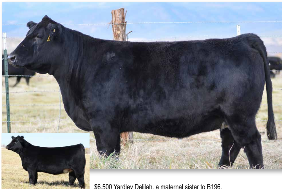
$6,500 Yardley Delilah, a maternal sister to B196.

POLLED 5/8 SM 3/8 AN BD 3/7/2014 ASA 2941322