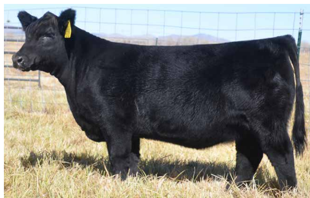
Yardley Eye Candy maternal sister to lot 125.