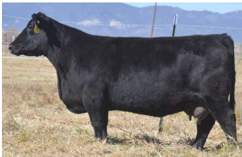
Stunning donor dam of Yardley High Roller