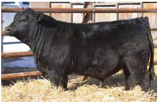
Yardley Boulder B358, a maternal brother to Lot 51.