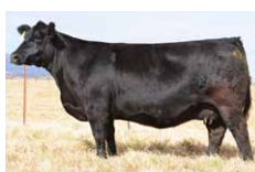
Donor Dam of C138

PE 6/13/2017 NORTH FORCE 7/15/2017 LOVERBOY