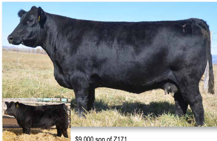
$9,000 son of Z171.