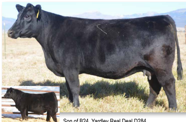
Son of B24, Yardley Real Deal D284.