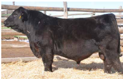
$6,500 son selected by Los Banos Creek of California.