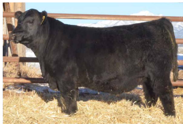
Deep bodied maternal brother to A24