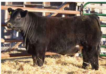
Big hipped son of 192Y