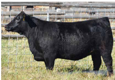
Feminine daughter of 192Y