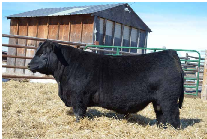
Soggy son of lot 156