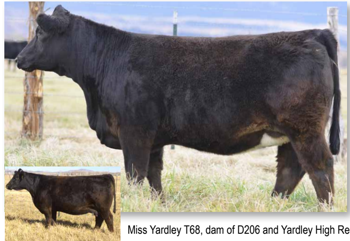
Miss Yardley T68, dam of D206 and Yardley High Regard.

It is rare to find a standout maternal sister to a breed icon like High Regard for sale. His daughters have caught the eye and won the hearts of astute cattlemen across the nation as they have commanded top dollar and won purple ribbons everywhere they go. The maternal backing of this powerful bull combine with another popular bull, Combustible, the Reserve Champion Simmental at Denver several years back. Many of his daughters have sold for more than $15,000. In short, D206 has genetic backing to impact your herd for years to come.