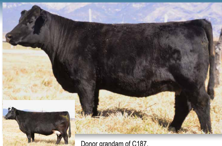
Donor grandam of C187.