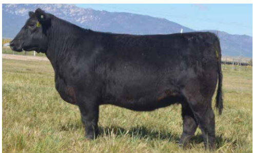
$16,500 maternal sister to B235.