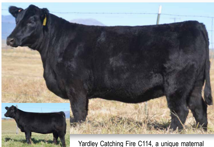
Yardley Catching Fire C114, a unique maternal sister to D178.