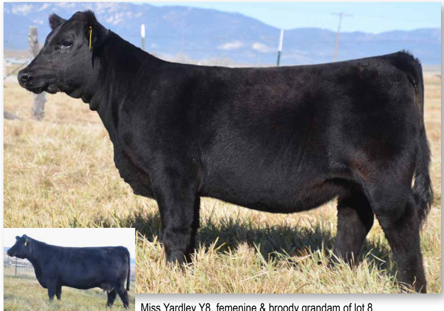
Miss Yardley Y8, feminine &amp; broody grandam of lot 8

Empress moves out with the confidence of a queen, and why shouldn't she with the look of royalty? She's stylish and square in her design with exceptional leg and foot structure, level topped, big butted and smooth across the tail head. Her sleek smooth design is one that will look good in purple, and she'll be wearing plenty of it with her look of excellence. A powerful made maternal brother to Empress's dam was a $7,000 sale highlight purchased by Quinten Harper of Walden CO.