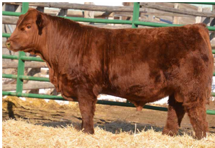
Yardley Trade Name D303, son of Z35.