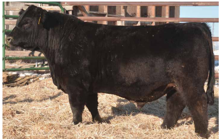
Yardley Wind River, produced by a maternal sister to D89.