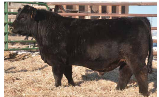
Yardley Wind River

You'll love the depth and capacity of this stout hipped female. Her sire, and former Denver champion, Real Steel, consistently stamps "the look" to his offspring.