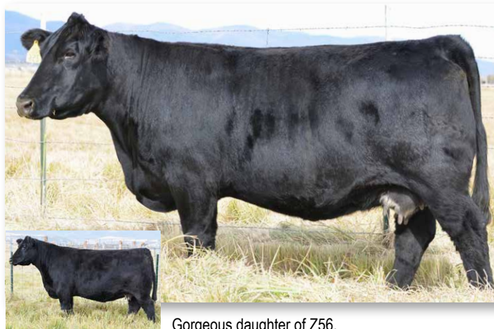
Gorgeous daughter of Z56.