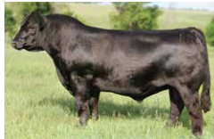
Yardley High Regard