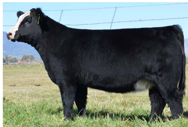
Yardley Charmed C41, a standout show heifer by A146.