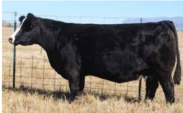
Powerful maternal Grandam W185