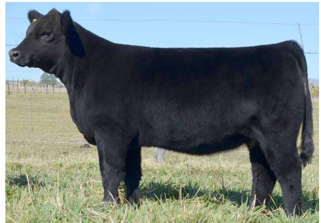
Yardley Catalina C241, a stylish heifer by Z150.

One of our families memory building experiences and enjoyment is moving our cattle from Asay Creek, 25 miles to high country where they summer at 9 to 10,000 feet elevation. There is no more beautiful country on earth. The grass is strong and it is a summer haven for our cattle and us. Our cattle graze year round on grass and browse ranges. We live in an area where we still embrace the heritage of the Old West. Our livestock culture still survives where the valley and sagebrush lie in the shadows of majestic mountains under endless sky....where the solitude is not loneliness but a refreshing peace from the modern world. Our natural beauty is preserved and enhanced by the practical stewardship of reputation cowboys and cowmen....whose lives are shaped by the dominant environment.