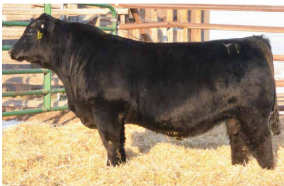
Powerful Yardley Profit D283, son of Z67.