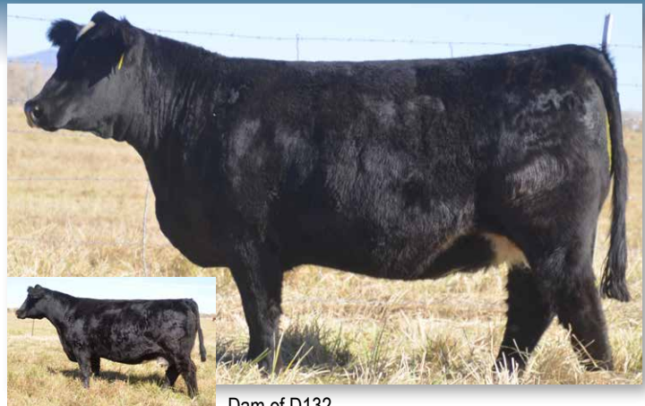
Dam of D132.