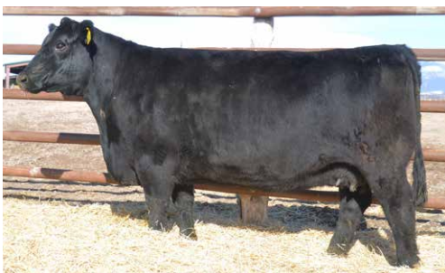
Beautiful donor dam of B235.

B235 blends style, length of body, tremendous width and dimension with a pedigree stamped for performance, quality and profitability. She comes by her perfect udder, exceptional structure, and flawless design honestly. Her phenomenal donor dam, W172 has been one of the prettiest and profitable herd matrons in the Yardley herd producing $20,000 and $16,500 sale highlights in our '15 Focus On The Female Sale. Another full sister to A235 produced Yardley Doll Face, our '16 high selling feature show heifer purchased by Greg Kroupa of SD for $24,000. A235's calf adjusted to 781# this year for an in herd WW ratio of 110 and is one of the best bull calves on our ranch. Productivity, performance, pedigree, phenotype, and profitability, she's got them all and she could be yours.