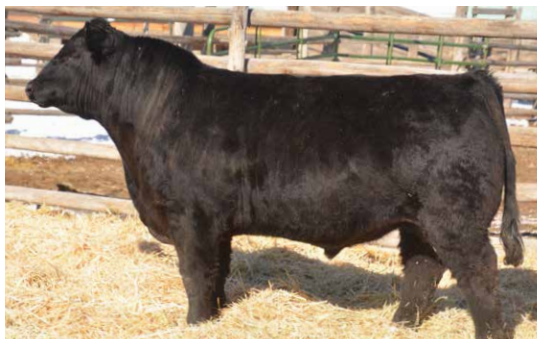
Impressive first calf by B182.