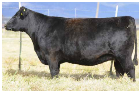
Maternal sister to Z82 that also sells as lot 63.