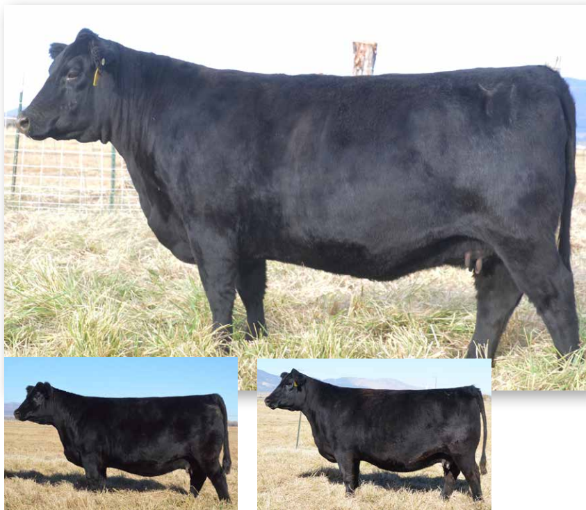
Powerful donor dam of B158.