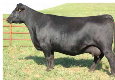
Dam of SAV Catalyst 0491