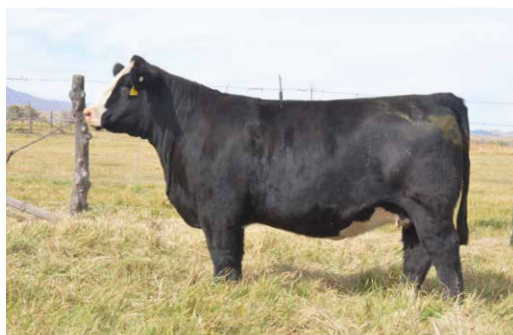
$11,000 maternal sister to lot 155

X125 is loaded with performance. Her calves have weaned off averaging over 700# on five calves including an $8,500 bull calf purchased by repeat customer Greg Shawcroft of Lahara, CO. Her powerful dam is one of my favorite old girls on the ranch and hails from a cow family of cornerstone herd matrons. She has averaged over 700# and ratioed at 109 on eleven calves. Her maternal grand dam was a grand old cow that was as massive muscled and powerful as any cow on the ranch that lived to be fourteen and always brought home a nice calf in the fall and stayed fat doing it.