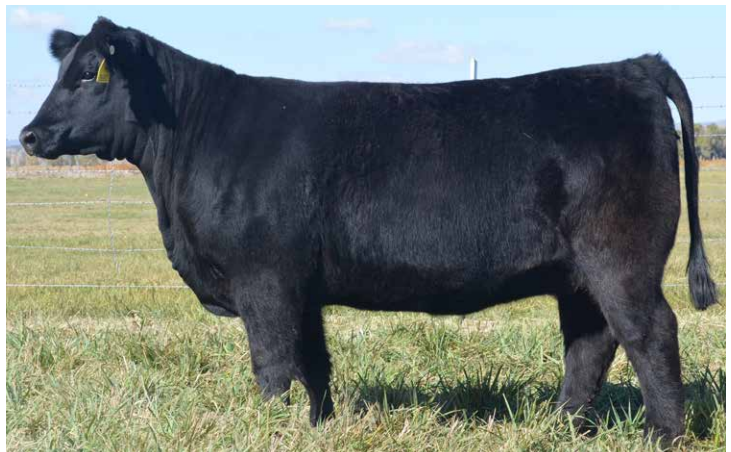
Eye catching daughter of W84.