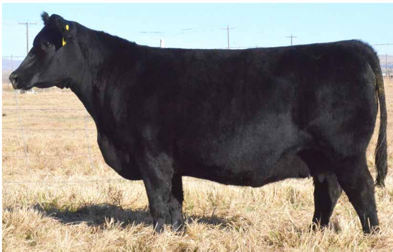
Beautiful Grandam of D17.