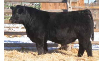
D287 a sylish maternal brother