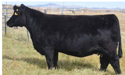
Outstanding dam of lot 110.

POLLED 1/2 SM 1/2 AN BD 2/18/2016 ASA 3218579