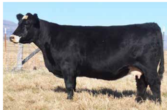
Functional maternal grand dam of lot 120