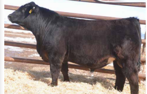
Yardley Heartbreaker D478, son of A231.