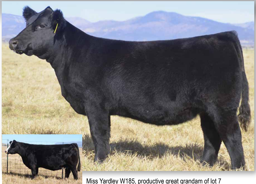
Miss Yardley W185, productive great grandam of lot 7

Elegance has the accolades and attitude of a true lady. She moves out on a powerful hip with show stopping eye appeal and charisma. She draws her dominant strength and design from a long line of elite, feminine, powerhouses tracing back to her fourth dam H27, a broody made easy fleshing donor whose lasting positive impact can still be traced through many of our prettiest, productive and profitable cow families and donor cornerstone matrons, including M100 and Elegance's third dam, a donor sired by the immortal Meyer 734. Elegance's potential as a high quality show heifer pale in comparison to her genetic merit that will carry on long after she is gone. Dual registered ASA, AMAA.