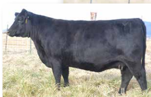
Dam of D25.