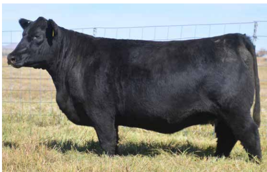
A maternal sister to the dam of Lot 51.