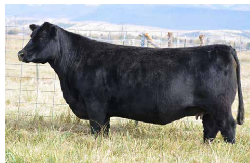
Yardley Z67 dam of Profit