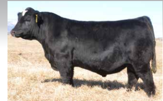
Yardley Top Notch, powerful sire.