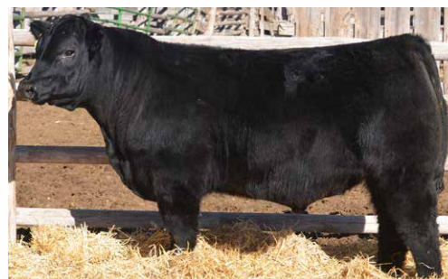
Yardley Big Step, the high-performing sire of D87.