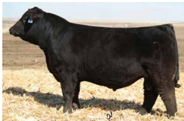
CCR Cowboy Cut