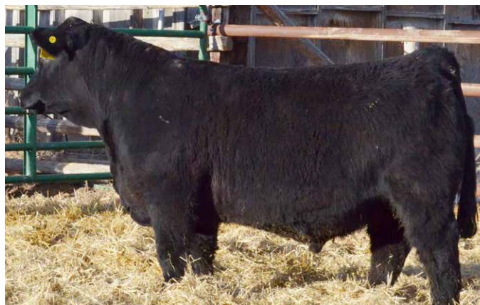
Maternal brother to B23.

What a way to start our Simmental cows. B23 has been one of my favorites since day one. She has exceptional length, depth, width and balance that begin at her nice front end, extend through her strong top and massive middle and carry down to her deep flank, nice udder, and powerful hind quarter. She is supported on a perfect structure with a big hoof, ideal bone and leg set with a nice quiet disposition. She will leave you with a lasting impression and make you wish you had a hundred more that look just like her!