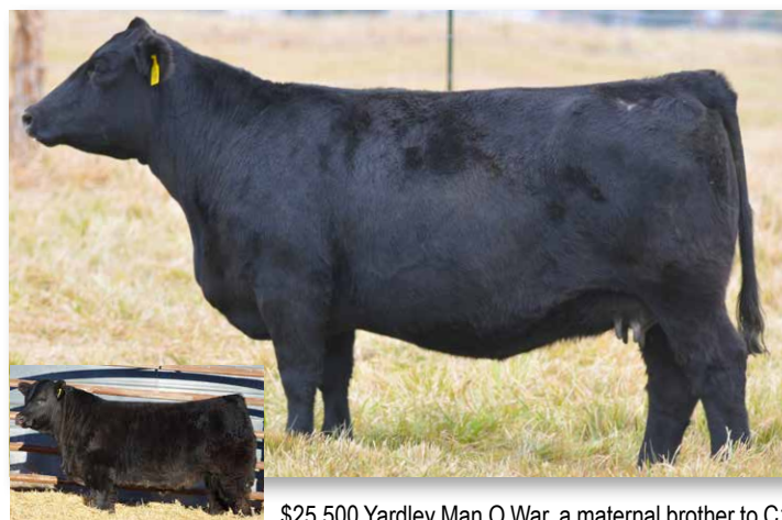
$25,500 Yardley Man O War, a maternal brother to C138.

C138 was one of my three favorite heifers in our entire calf crop when we weaned her as the heaviest heifer in our crop at 813# adj. Her phenotypically flawless donor dam is as broody, deep bodied, and nice fronted with as much rib and capacity as I have encountered and an impeccably flawless structure. She is the mother of our '14 high seller Man O' War purchased by Barker Cattle Company of Elba ID for $25,500.