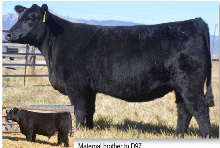
Maternal brother to D97.