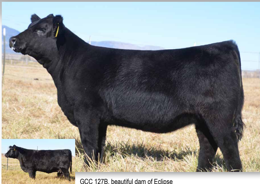
GCC 127B, beautiful dam of Eclipse

Eclipse is something of a natural phenomenon. She has the look and design that won't leave you in the dark for long. You'll appreciate her amount of capacity, added length, huge hip, powerful lower quarter and exceptional bone in a surprisingly feminine package. You'll love her rich, true black color, perfect hair, fancy features and amazing eye appeal. Her rock solid, extremely complete dam caught our attention in Griswold's sale and Lori and Toby's since then. Her dam's maternal sister sold for $10,000. Yardley Showdown, her sire, was our $18,500 '12 high seller purchased by Griswolds.