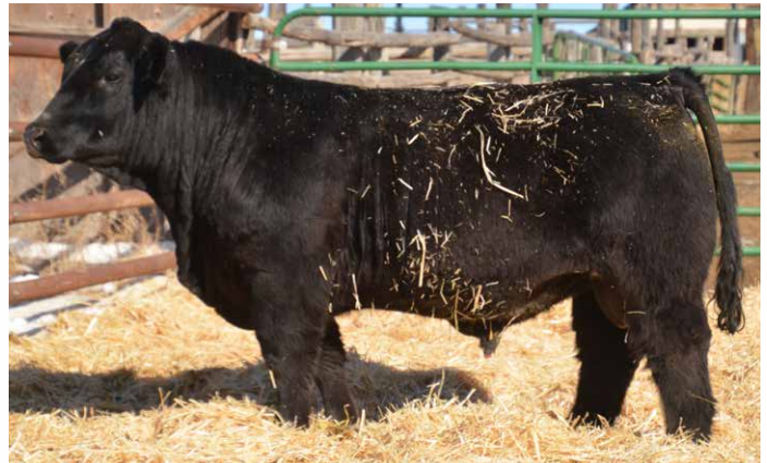
Stout made son of B125.