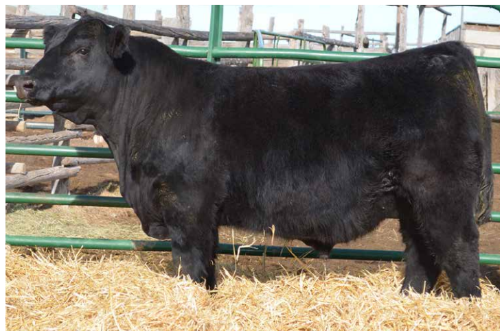
Powerhouse son of Y88.