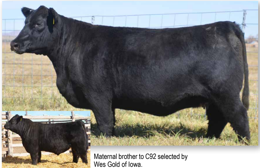
Maternal brother to C92 selected by Wes Gold of Iowa.