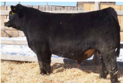
Yardley Blazing Gun, $10,500 maternal brother