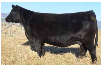
Maternal sister to X136.