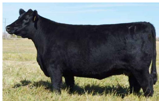
2016 lead-off Angus bred cow and daughter of T164.

We place highest of confidence in this stellar, big volume, perfect uddered donor that is loaded with rib and structural correctness. She has produced two powerhouse herd sires that are currently in our bull battery; Aspen and High Roller. Her elite, feminine made daughter was our lead off Angus female in last year's offering going to Mike Sinon of NY. Her offspring has averaged over 680# at weaning defining her as a female who consistently produces pounds of product in the right package with exceptional shape and dimension.