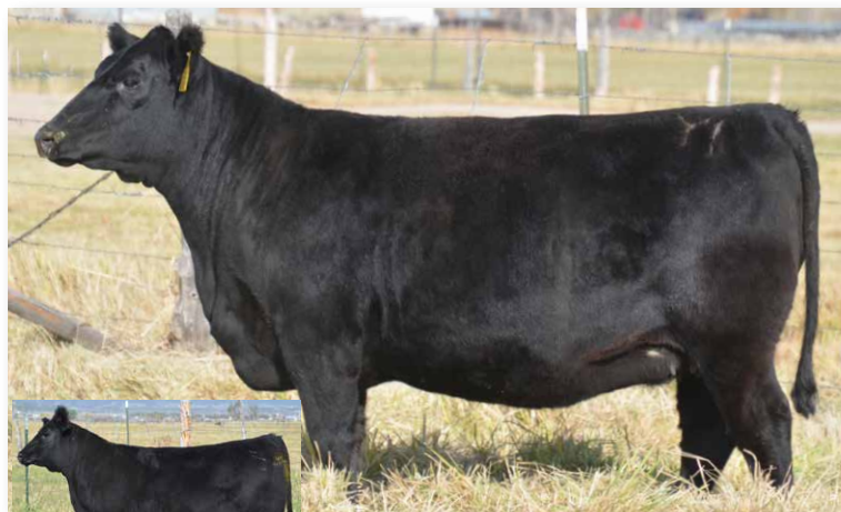
$6,000 maternal sister to D30.