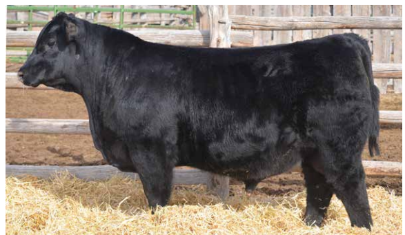
$18,000 Yardley Cornerstone, a full brother to D121.