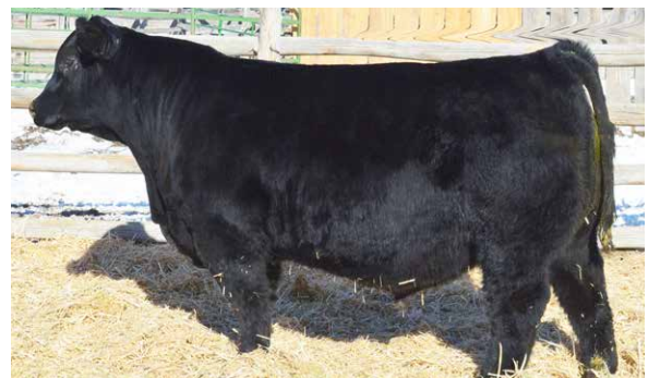
Yardley Stonewall, full brother to D121.