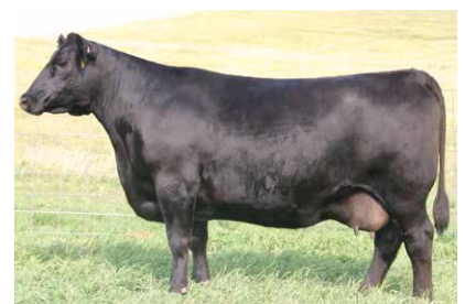
Grandam of SAV Catalyst and dam of SAV Patron.