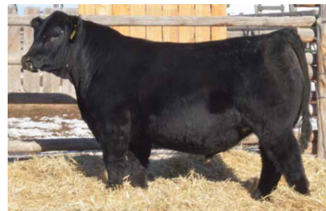
Son of Z82 selected by Kline Esplin.