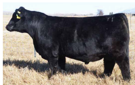
Yardley High Roller, son of T164.