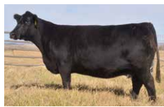
Magnificent Dam of D97