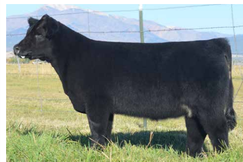
$8,000 full sister to the dam of D12.