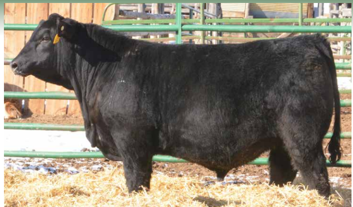
$17,000 maternal brother, Yardley Worldwide D302.