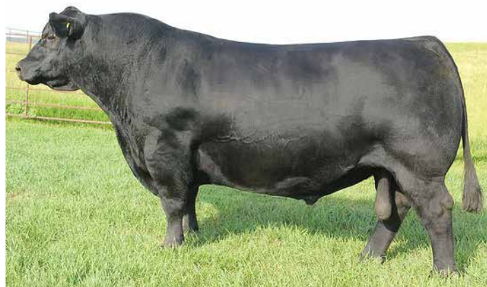
SAV Harvester renowned sire of Lot 55

$275,000 SAV Harvester has gone down in the history of the Angus breed as one of the most popular, powerful Angus bulls of all time as a true breed changer and performance powerhouse. With progeny built right from the ground up. His sons include popular breed icons $400,000 SAV International and $275,000 SAV Cutting Edge. B181 exemplifies the characteristics that make his daughters so sought after. She is deep bodied, feminine with beautiful udder and added dimension and rib shape. Her broody, big bodied heifer calf weaned off at 725# with a 115 WW ratio.