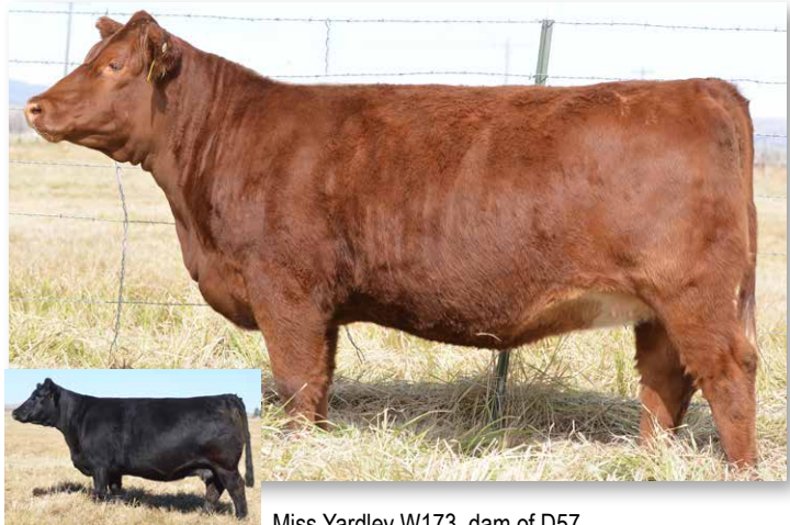
Miss Yardley W173, dam of D57.