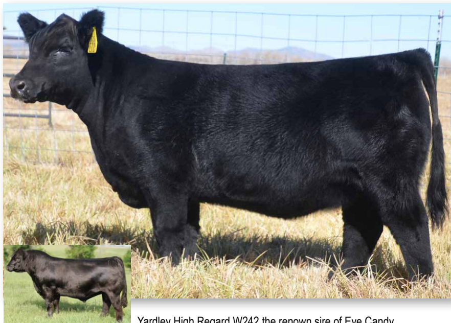
Yardley High Regard W242 the renown sire of Eye Candy

Her deep body, big hip, smooth shoulder and nice front blend together in a well-balanced, structurally correct, perfect package. Eye Candy is a joy to look at. Her puppy dog personality is sure to build confidence and make a pleasant experience for the young show person. Her first rate, beautifully uddered, powerfully made dam is packed with performance. As a first calf heifer she weaned a 707# heifer calf. She was Jose Garcia's pick of the entire heifer herd. Eye Candy's sire, Yardley High Regard needs no introduction as the "go to" sire for making mouthwatering show heifers and sale toppers.