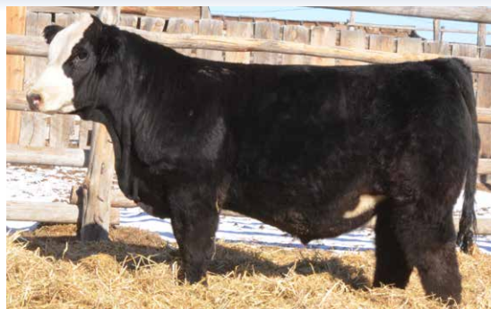
2017 lead-off bull and maternal brother to B120.