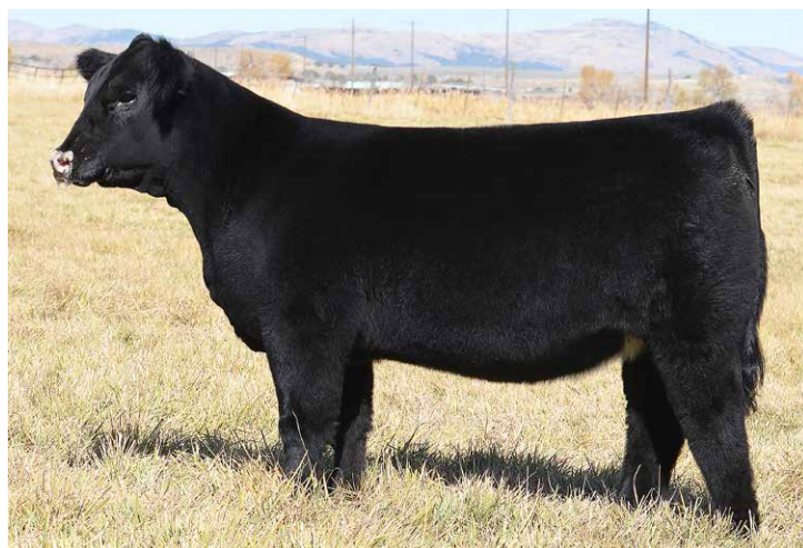
$24,000 Yardley Doll face.