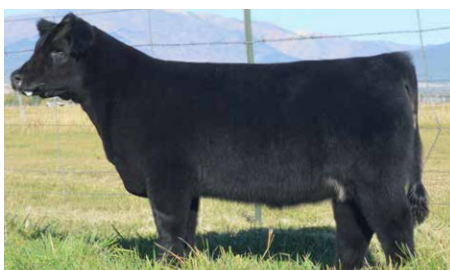
$8,000 full sister to the dam of D234.