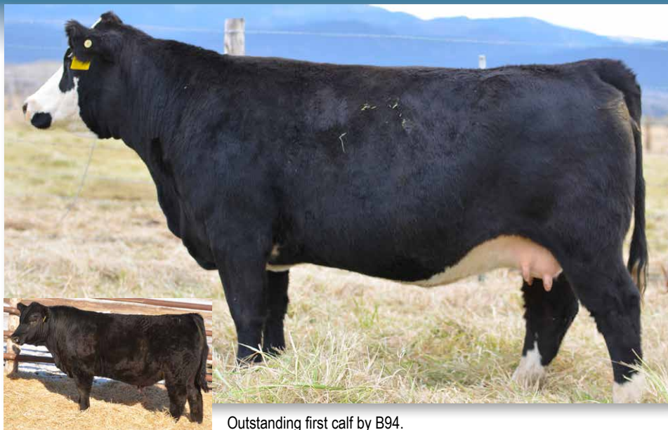
Outstanding first calf by B94.

POLLED 3/4 SM 1/4 AN BD 3/22/2014 ASA 2941366