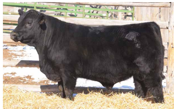
Massive maternal brother to Z67.