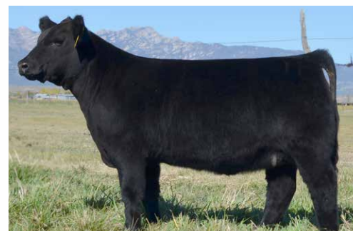
Beautiful maternal sister of lot 104.