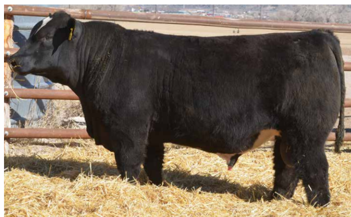
$13,000 Yardley Cottonwood, son of W44.