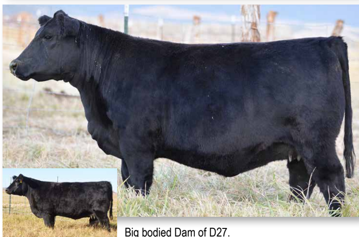
Big bodied Dam of D27.