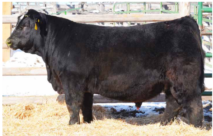
Yardley Titanium C377, a maternal brother to B144.