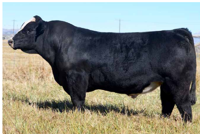
GCC Nickels N Dimes 124Z, sire of Enchantress

Enchantress's dominating look of excellence is magical. Her shear power, volume, length, depth and dimension extend from her excellent front, to her powerful hip and lower quarter. Her added rib and capacity will be appreciated by even the most novel showman. She'll catch your eye and win the judges heart. She comes by standout good looks honestly. Her functional, profitable, excellent uddered dam raised an $8,750 powerhouse son and had a maternal brother sell for $7,000. Let Enchantress cast a spell on you!