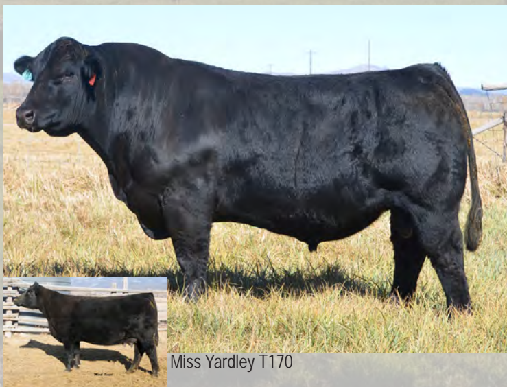
Miss Yardley T170