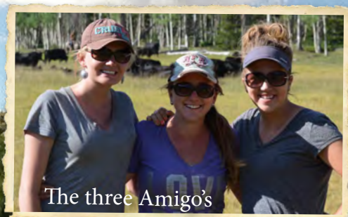
The three Amigo's