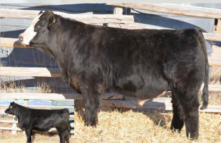
Miss Yardley W151

Joy's Elegance was Grand Champion in Denver in the Junior show and matured into as picture perfect cow as she was show heifer. A true test of a great show heifer doesn't come in the showing, it comes in her ability to produce and transmit the same look and quality in her offspring. Joy's produced $106,000 in progeny sales this past year on four head with one of the most consistent flushes ever produced at Griswold Cattle. The two yearling heifers produced are proving to be as competitive in the show ring as their great dam. Nickels n' Dimes is big topped and complete with plenty of rib, dimension, style and power with a killer look. This is the kind of bull to change a program with! Owned with Griswold Cattle.